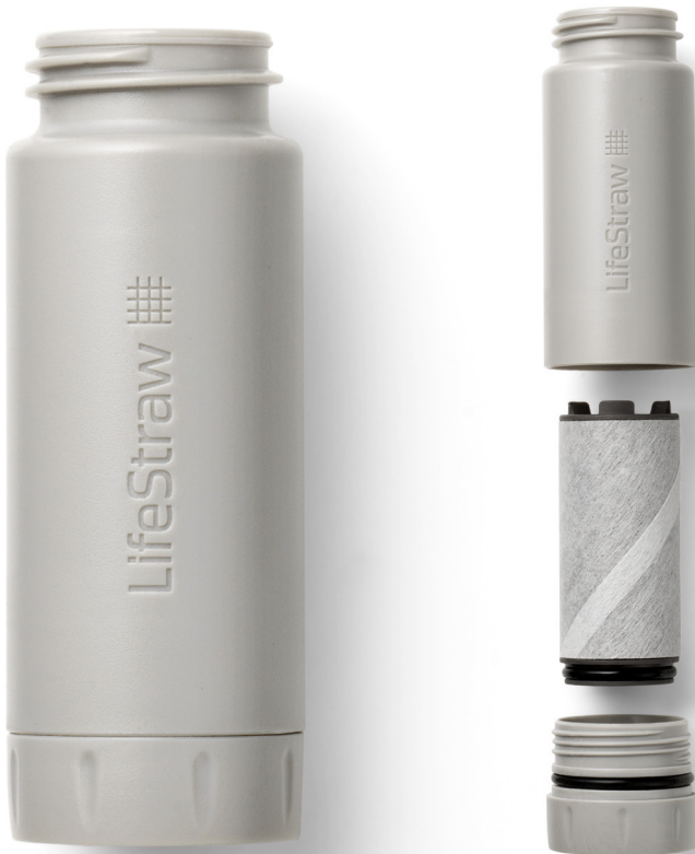
Peak Gravity 8L