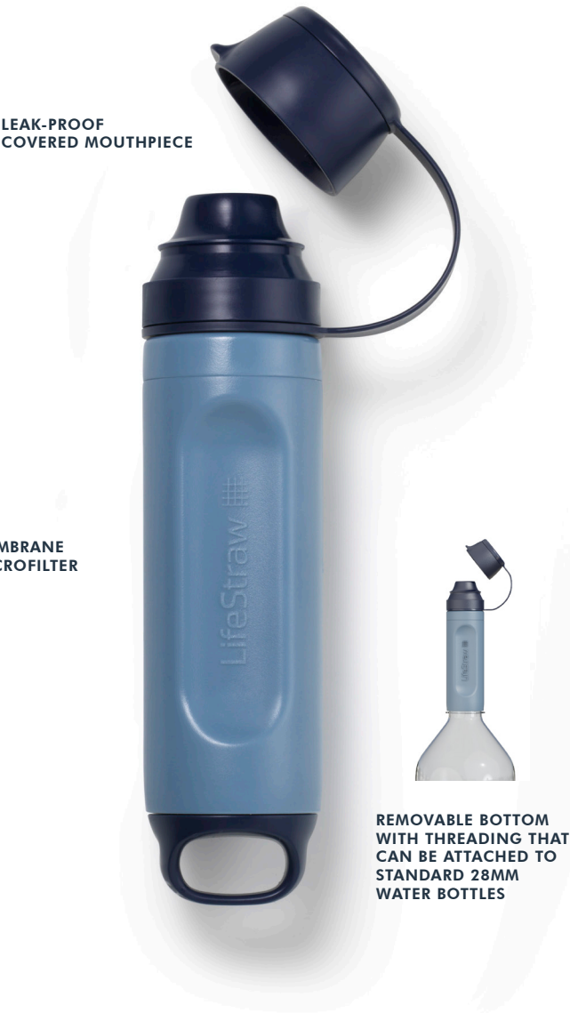
LEAK-PROOF COVERED MOUTHPIECE

Weight: 1.7oz | 48.2g Height: 5.1 x 1.3in | 12.9cm x 3.30cm