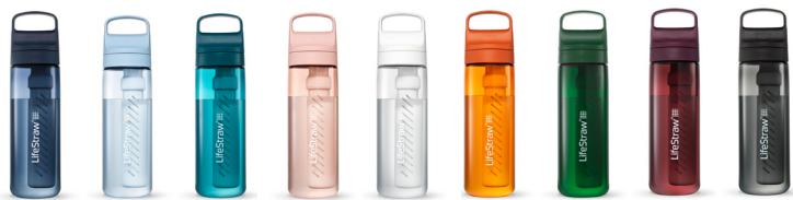
Aegean Icelandic Laguna Cherry Blossom Polar Kyoto Oxford Ivy Wild Mulberry Nordic Noir

The membrane microfilter lasts up to 4,000 liters. That's 8,000 single use plastic water bottles out of our parks, our oceans, and our communities.