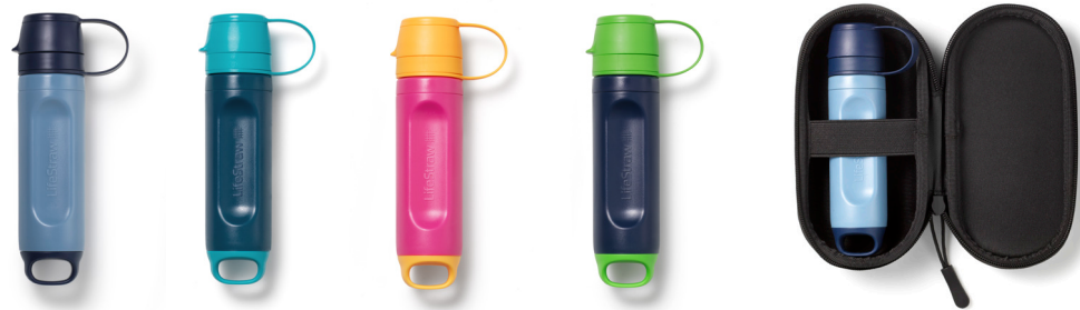
Mountain Blue Blue Raspberry Pink Lemonade Limeade Carry Case Add On

The Collapsible Squeeze Bottle System is designed with every occasion in mind. Use as a bottle, push water through it into cooking containers or other drinkware, use as a straw, or connect to other Peak systems.