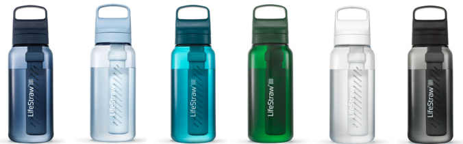
Aegean Icelandic Laguna Oxford Ivy Polar Nordic Noir

The membrane microfilter lasts up to 4,000 liters. That's 8,000 single use plastic water bottles out of our parks, our oceans, and our communities.