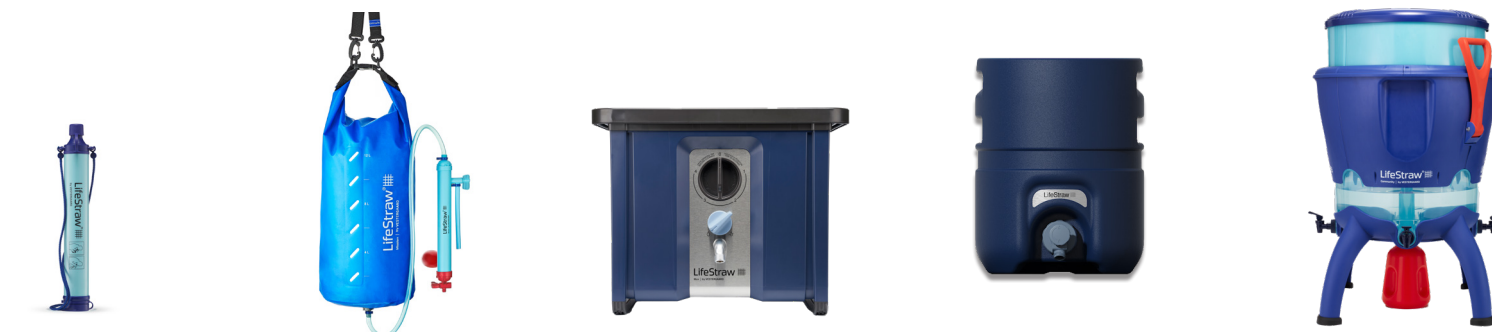
LifeStraw Personal Water Filter LifeStraw Mission High-Volume, Gravity Water Filter + Purifier LifeStraw MAX High-Flow Water Purifier LifeStraw Escape Pressurized Water Purifier LifeStraw Community High-Capacity, Long-Lasting Water Purifier