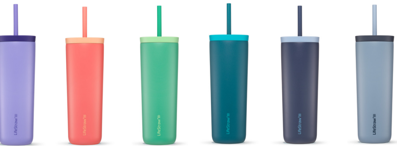
Thistle Apricot Cactus Laguna Aegean Icelandic

Weight: 1.07oz | 468g Height: 11in | 30.3cm Diameter: 3.4in | 8.6cm