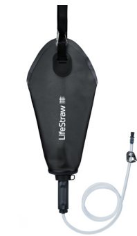
Dark Mountain Gray 3L