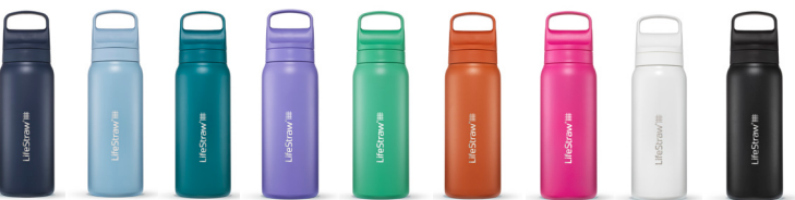
Aegean Icelandic Laguna Thistle Cactus Kyoto Orchid Polar Nordic Noir

Carbon filter + the membrane microfilter filters bacteria, parasites, microplastics, chlorine, and more while improving taste.