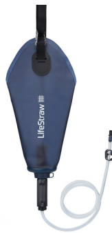
Mountain Blue 3L

2x thicker, premium materials make it tougher so no worrying about rips, tears or punctures.