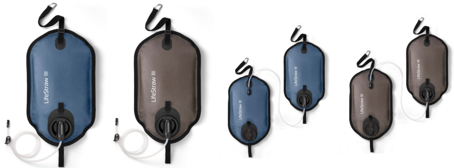
Mountain Blue 8L Dark Mountain Gray 8L Mountain Blue 8L+8L Dark Mountain Gray 8L + 8L

Made with premium materials resistant to punctures and rips during your travels.