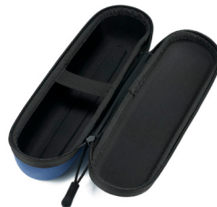
Add On Carry Case