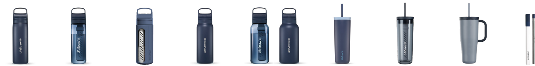
LifeStraw Go Series 18oz Stainless Steel