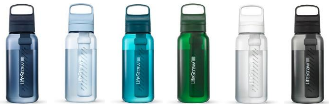
Aegean Icelandic Laguna Oxford Ivy Polar Nordic Noir

The membrane microfilter lasts up to 4,000 liters. That's 8,000 single use plastic water bottles out of our parks, our oceans, and our communities.