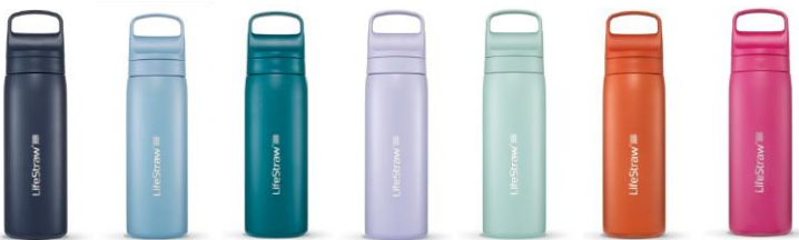
Aegean Icelandic Laguna Provence Seafoam Kyoto Orchid

Carbon filter + the membrane microfilter filters bacteria, parasites, microplastics, chlorine, and more while improving taste.