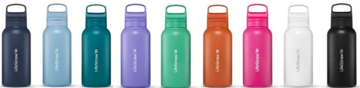
Aegean Icelandic Laguna Thistle Cactus Kyoto Orchid Polar Nordic Noir

Carbon filter + the membrane microfilter filters bacteria, parasites, microplastics, chlorine, and more while improving taste.