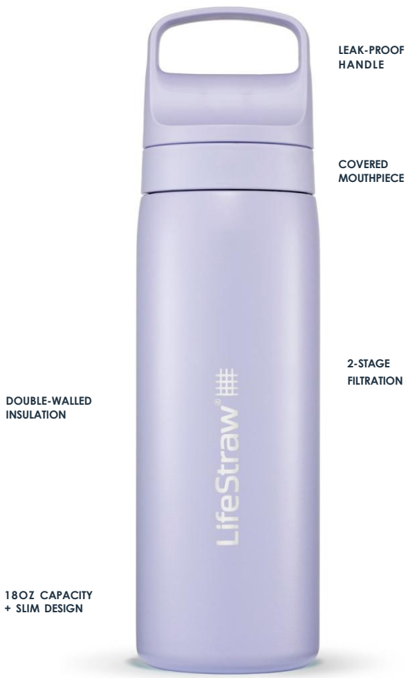
LEAK-PROOF HANDLE COVERED MOUTHPIECE 2-STAGE FILTRATION DOUBLE-WALLED INSULATION 18 OZ CAPACITY + SLIM DESIGN

Weight: 500ml | 468g Height: 11 in | 28cm Diameter: 3.14 in | 8cm