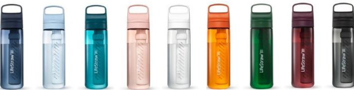
Aegean Icelandic Laguna Cherry Blossom Polar Kyoto Oxford Ivy Wild Mulberry Nordic Noir

The membrane microfilter lasts up to 4,000 liters. That's 8,000 single use plastic water bottles out of our parks, our oceans, and our communities.