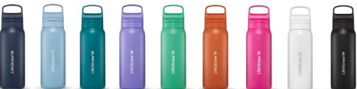
Aegean Icelandic Laguna Thistle Cactus Kyoto Orchid Polar Nordic Noir

Carbon filter + the membrane microfilter filters bacteria, parasites, microplastics, chlorine, and more while improving taste.